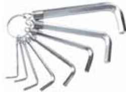
Allen key (8 size)