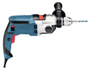
Hammer drill (tip \varnothing 12 mm)